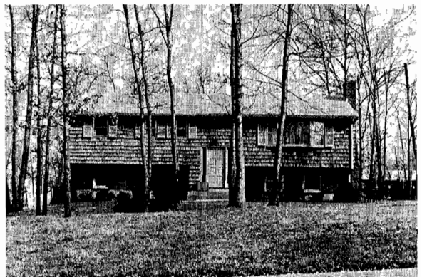
Figure 1. Example of a house with good tree cover.