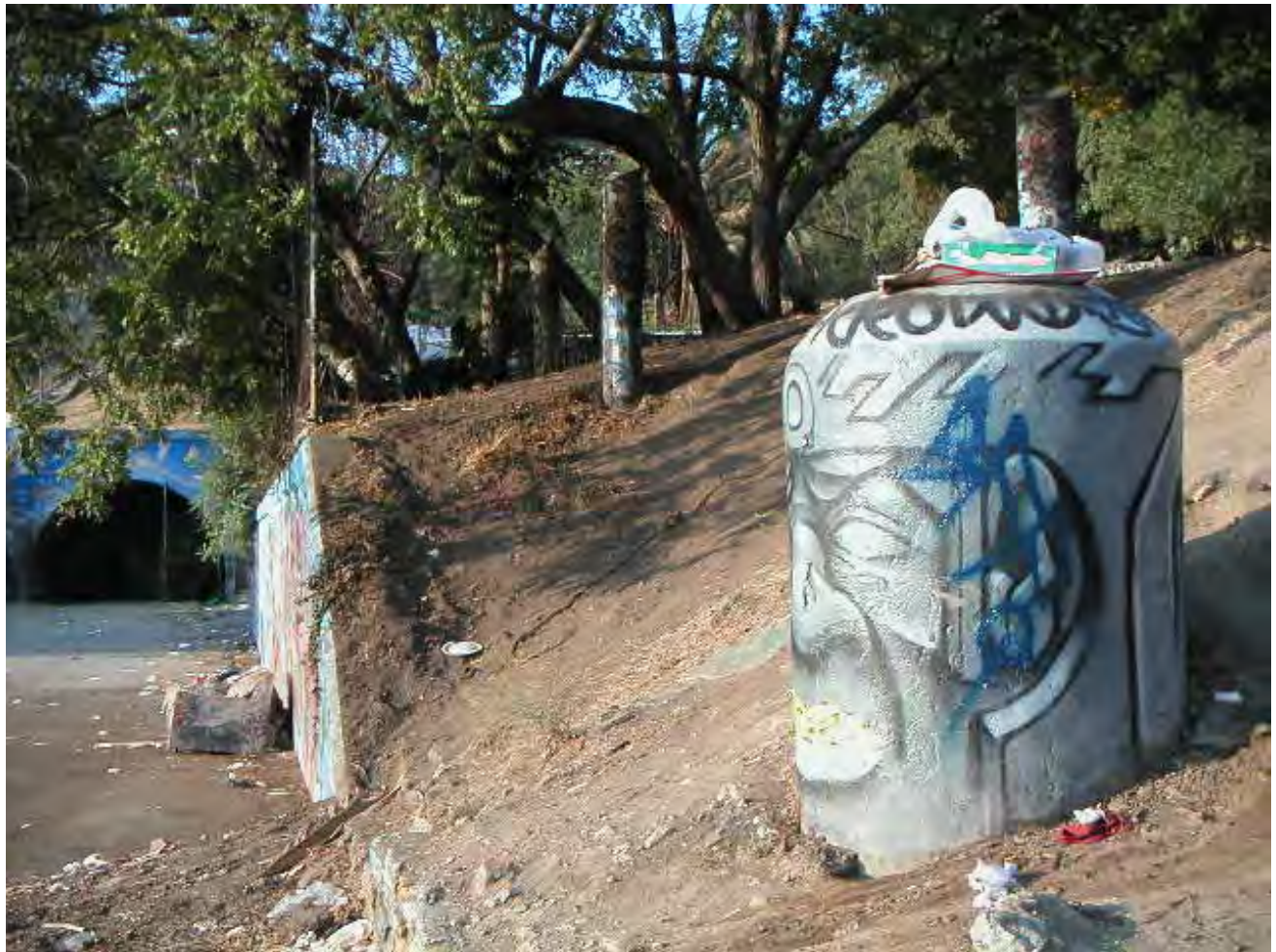
Figure 2. The railway tunnel proposed as a site for park space

This part of the discussion also uncovered their powers of observation and sense of frustration about underused spaces. One student stated: